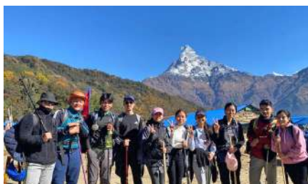
BBA-BI Students Mardi Trek 1