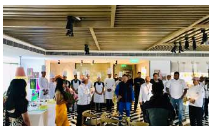
Student's visit to Chef Competition at Aloft, Kathmandu