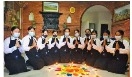
Dipawali Celebrated by Students at College Lobby area.