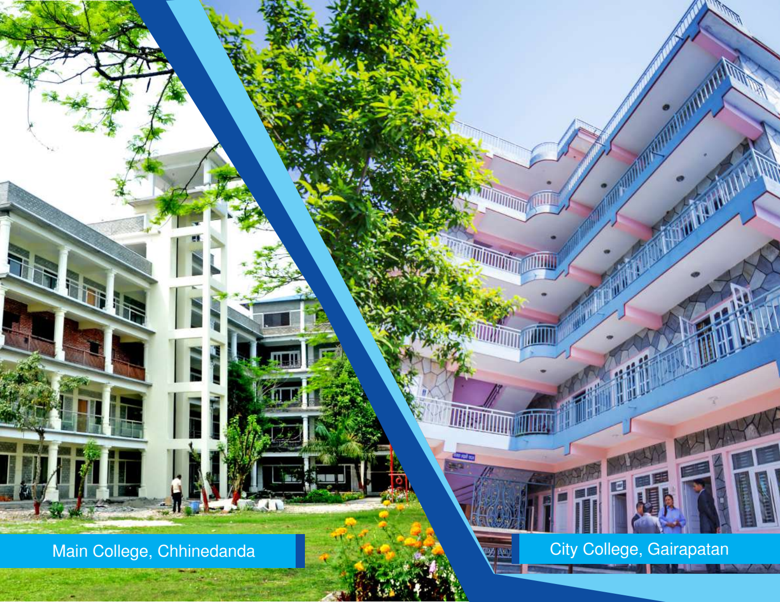
Main College, Chhinedanda