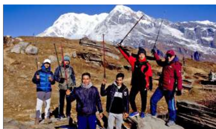
Adventure trip by BBA students