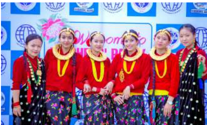
Welcoming the Fresher's.