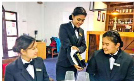
Learning to read the label of Wine.