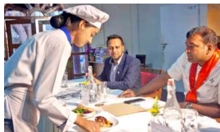
Chef Competition program at college