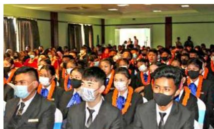
Welcome program for grade 11 Student at Mount Kailash Resort, Pokhara.