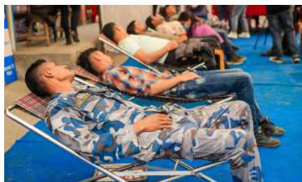
Blood Donation program organized by Entrepreneurship Club