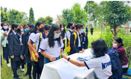
Covid Vaccination Program at College (1 st & 2 nd Dose)