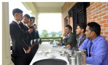
Students attending Viva-Voce.