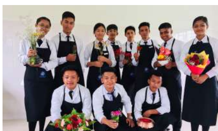
Flower decoration session at college for BHM students