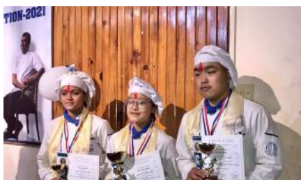
Winners of Chef Competition 2021.