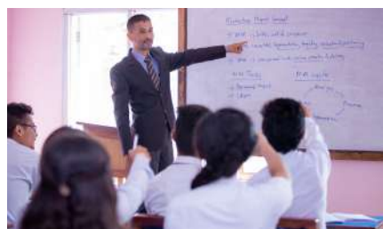
BBA students at classroom