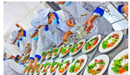
World Class Dish prepared by our students during their practical.