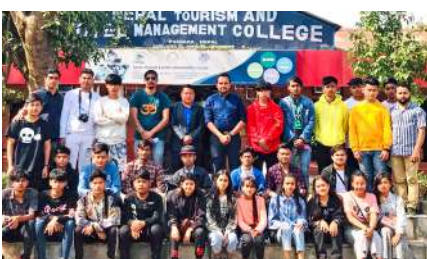
Welcoming the hotel management students from Devdaha College