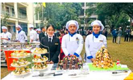
We are ready to served "Dessert".