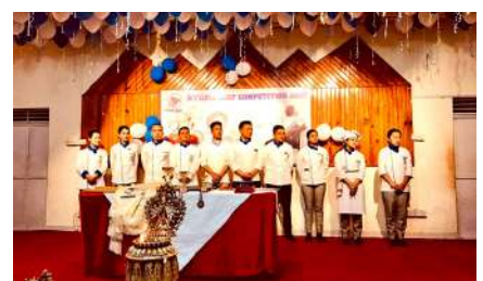
Finalist for Chef Competition 2021.