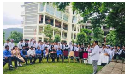
Students celebrating "Teacher's Day" at the college