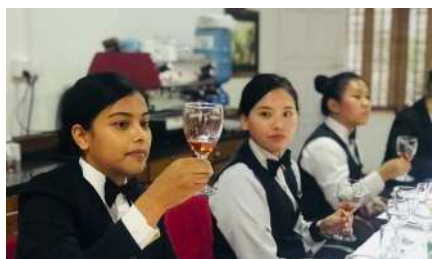
“Wine Testing” session for BHM students