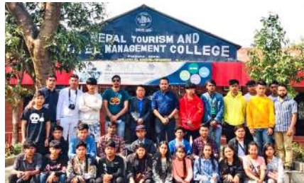
Welcoming the hotel management students from Devdaha College