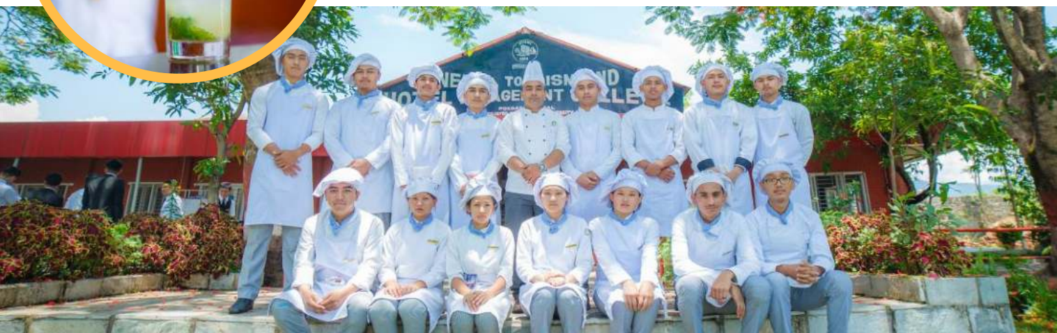
"A College Dedicated to Academic Excellence and Professional Competence"