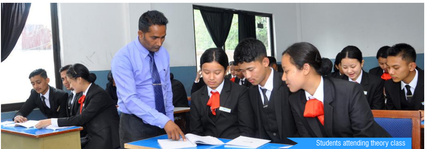
Students attending theory class

"A College Dedicated to Academic Excellence and Professional Competence"