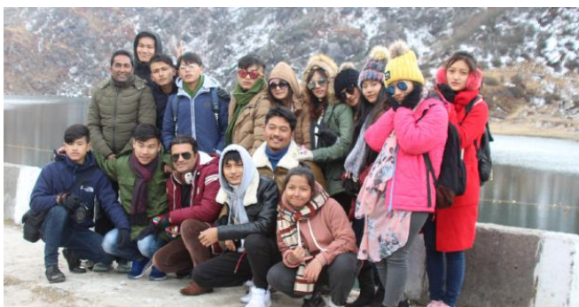
Students visited at Sikkim