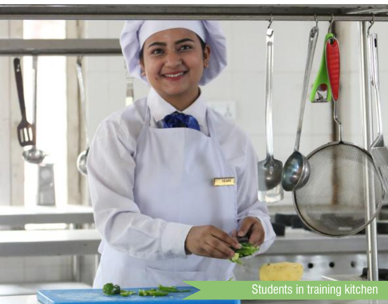
Students in training kitchen