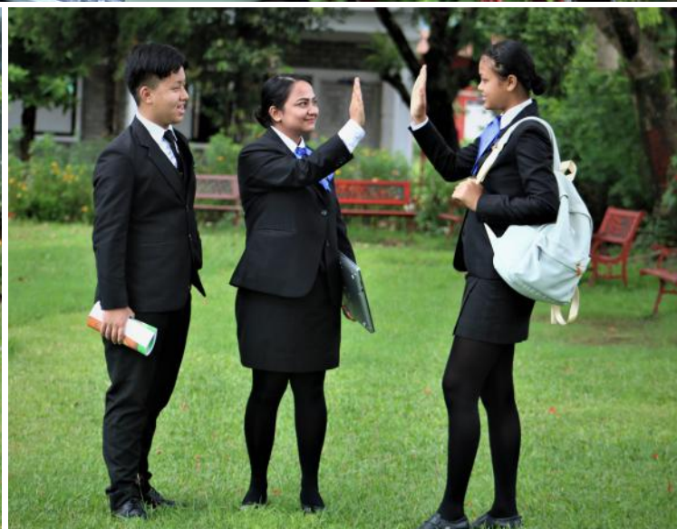
Students sharing ideas in peaceful environment

"A College Dedicated to Academic Excellence and Professional Competence"