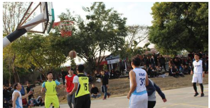
Students in Sports Meet