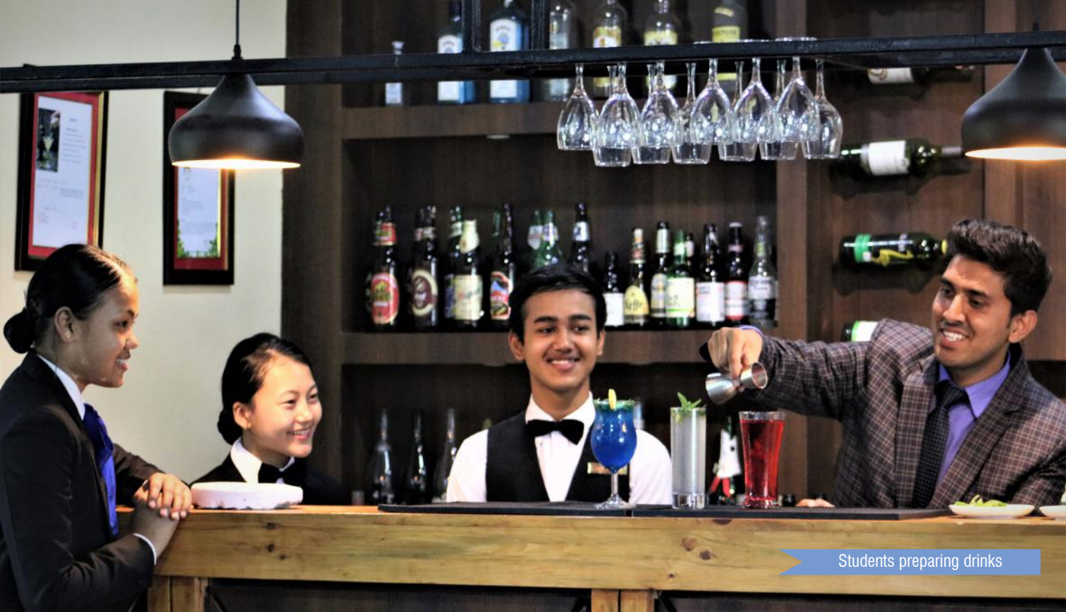
Students preparing drinks