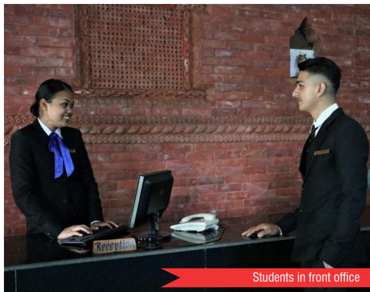
Students in front office